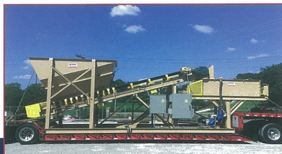
Rental Plants Available

Check out additional projects at: PUGMILLSYSTEMS.COM or give us a call at: 931-388-0626