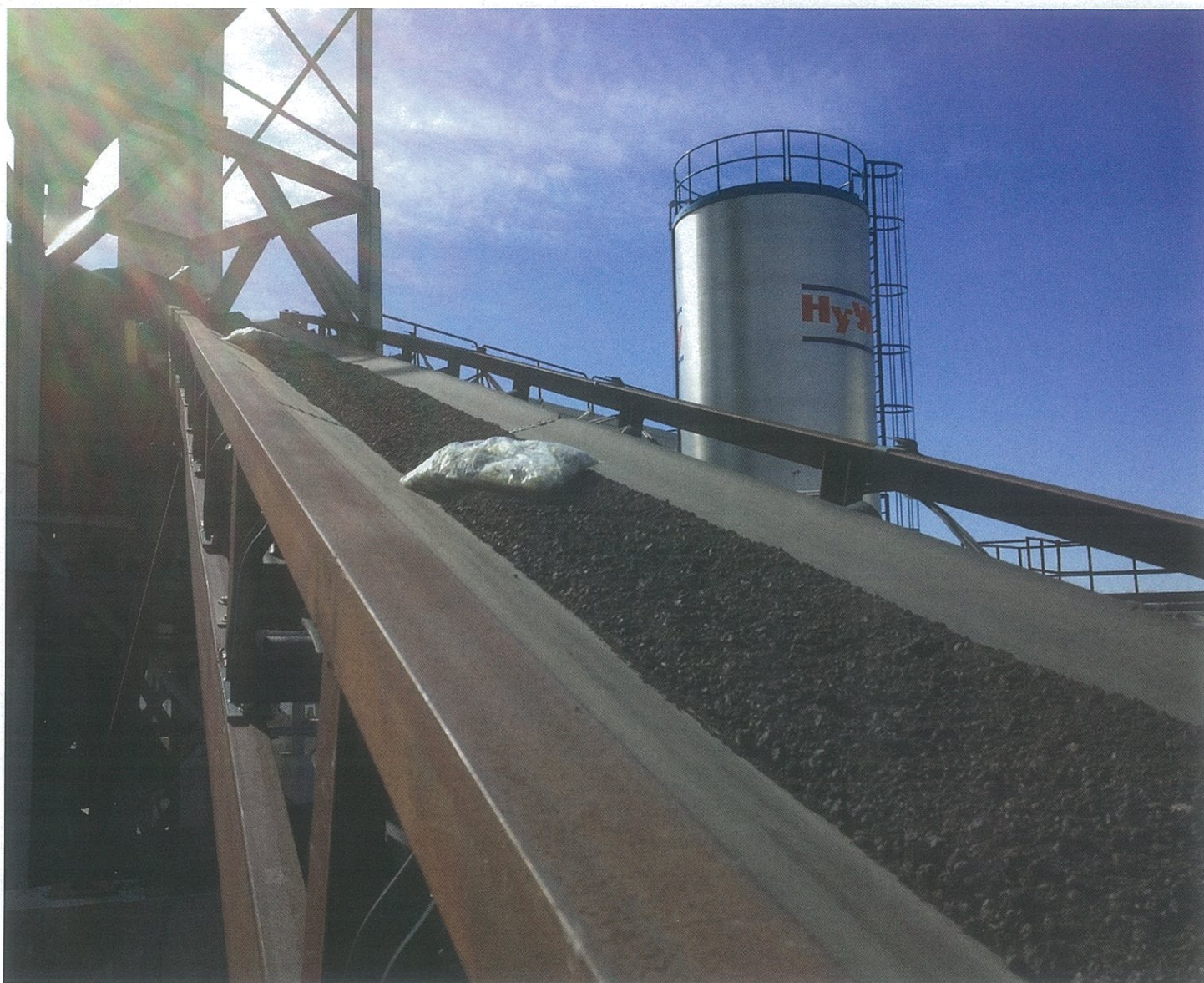
For the Babcock Road project in Brevard County, V.A. Paving Inc., Cocoa, Florida, produced an SP 12.5 mix with FORTA-FI reinforcement fibers for the structural lift and an FC 12.5 mix with FORTA-FI reinforcement fibers for the surface layer.